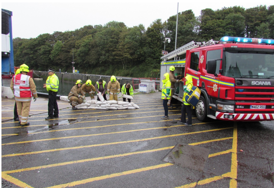
Partnership working in the Scottish Borders

Chair of the Scottish Borders Police, Fire and Safer Communities Board